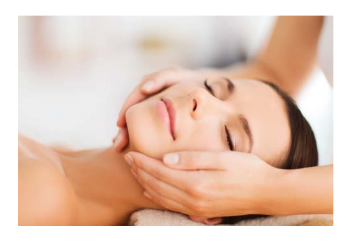
Cost: £120 per person or £220 per couple

Feel rejuvenated with eyes looking fresh, bright and youthful.